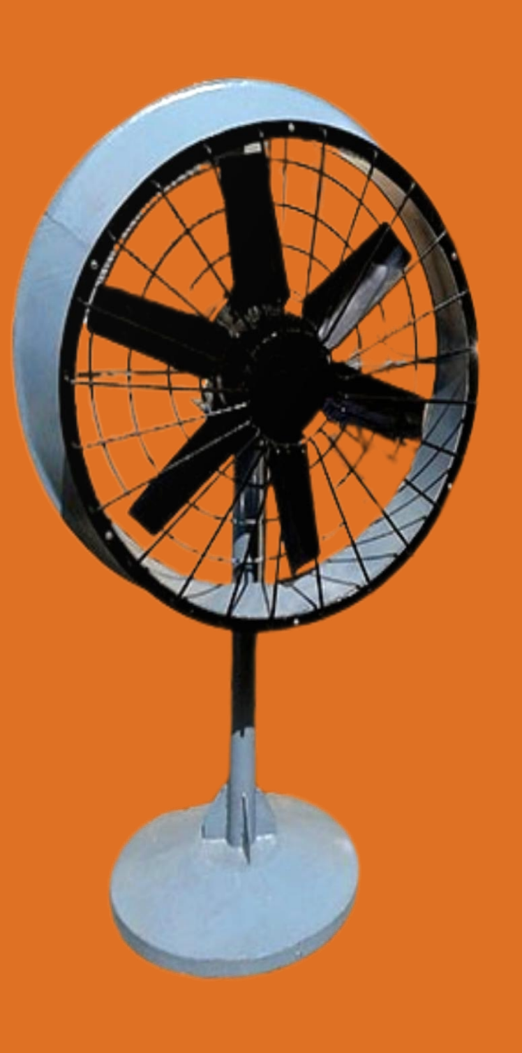
"High-Performance Cooling Solutions for Heavy-Duty Applications"